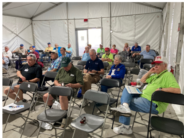
QCWA FORUM AT 2023 HAMCATION